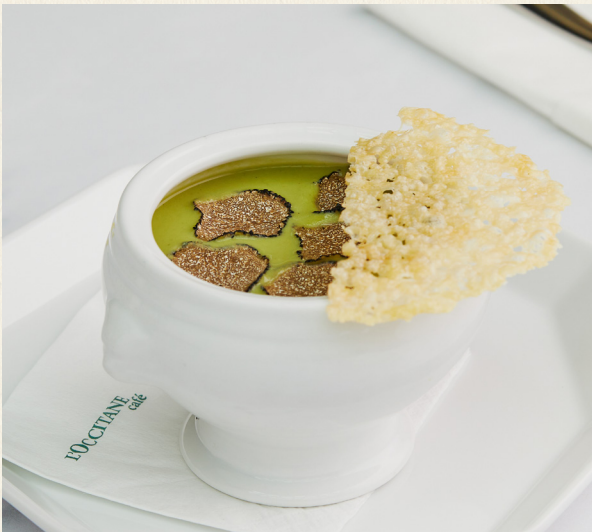
Broccoli Soup Dhs 45

Topped with olive tapenade, basil, and homemade crunchy garlic bread.