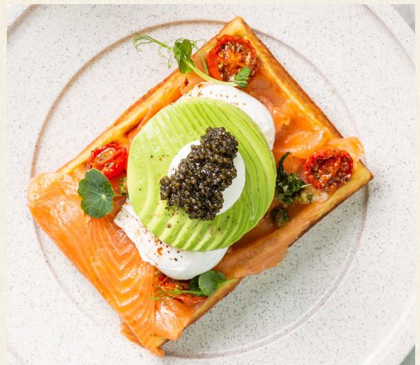
L'Occitane Waffle Dhs 90

Artisanal bread with sautéed kale topped with a crispy sunny side up egg and sesame seeds, served with avocado on the side. (D,N,G)