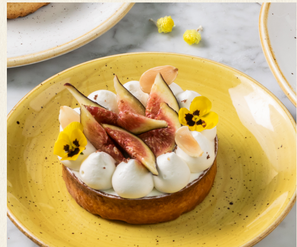
Fig Tart Dhs 39

Choux pastry filled with praline flavored cream garnished with roasted hazelnuts. (D,G,NV)