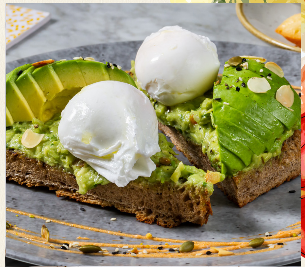
Avocado on Rustic Toast Dhs 70

Two poached eggs on brioche toasted bread served with tender beef cheeks, avocado and crispy potatoes. (D,G)