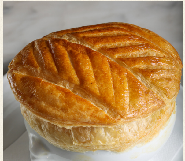
Lobster Bisque Soup Dhs 70

Creamy broccoli puree topped with black truffles and crunchy Parmesan crisp. (D, V)