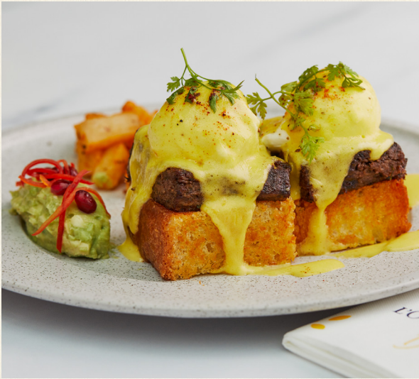
Beef Cheeks Eggs Benedict Dhs 82

Two poached eggs on brioche toasted bread served with tender beef cheeks, avocado and crispy potatoes. (D,G)