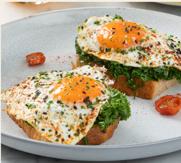
Kale & Egg Toast Dhs 75

Toasted artisanal bread topped with avocado & a triple seeds mix served with your choice of egg, along with a tofu vegan sauce. (G,N)