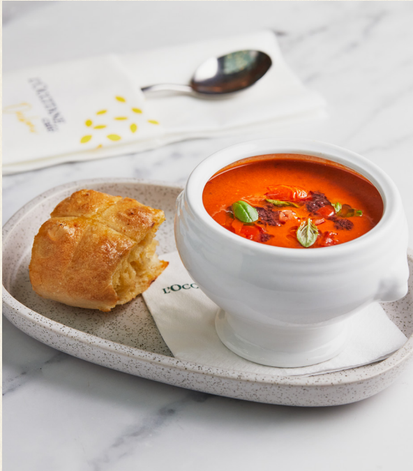
Soup of the Day Dhs 40